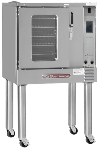
(PCHE75S/T shown with optional legs/casters)