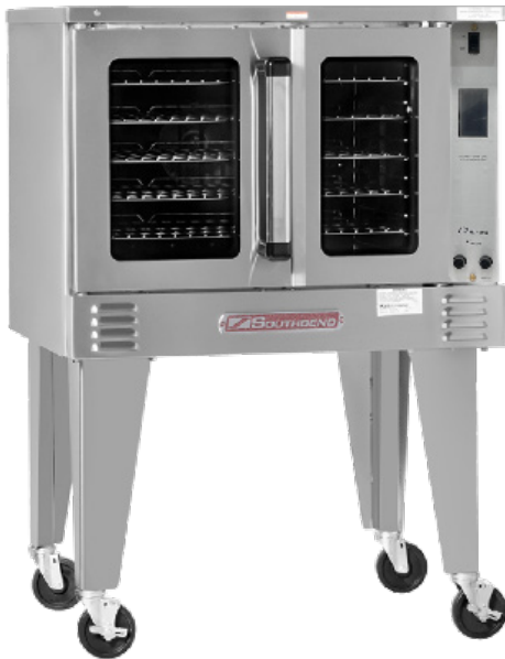
PCE75S/T shown with optional casters