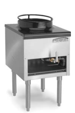
ISP-J-W13 Mandarin Wok Range