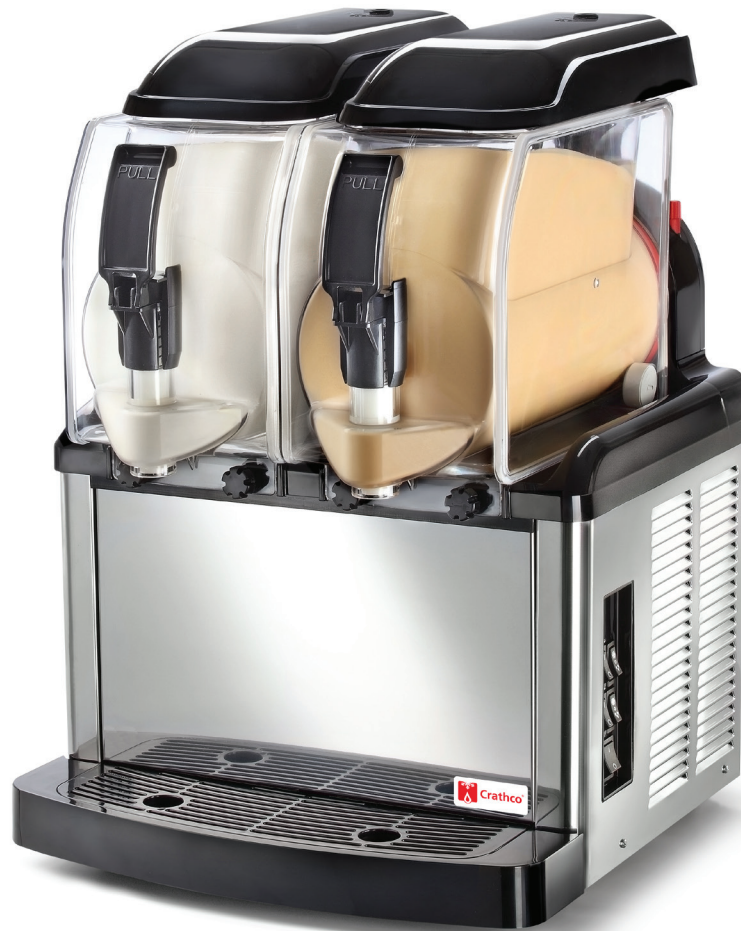
model SP 2