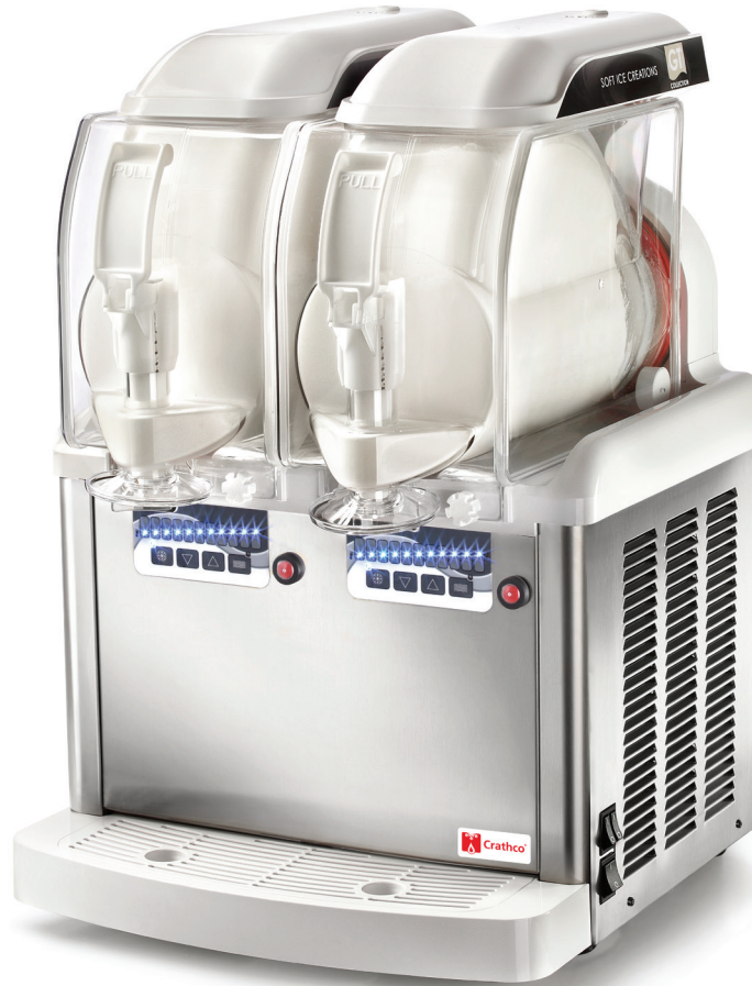
model GT Push 2