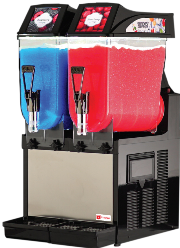
model Frosty 2