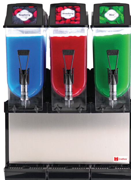
model Frosty 3