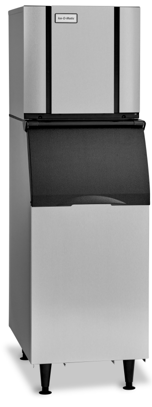
CIMO320 ON B/12