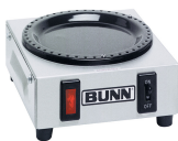
STOVE,WX1 120V/100W Product #: 06450.6000