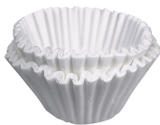
FILTERS,REG/1M Product #: 20115.6000