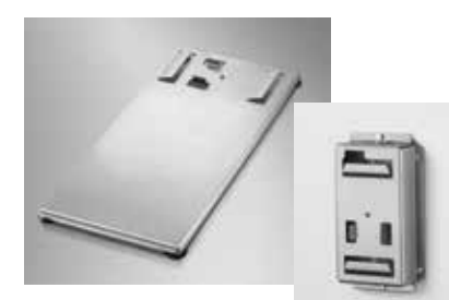
Suction Cup Table Base

Wall Dimensions: 9.5" x 15.0" x 30.0" 240mm x 380mm x 760mm Table Dimensions: 9.5" x 24.0" x 24.0" 240mm x 610mm x 760mm