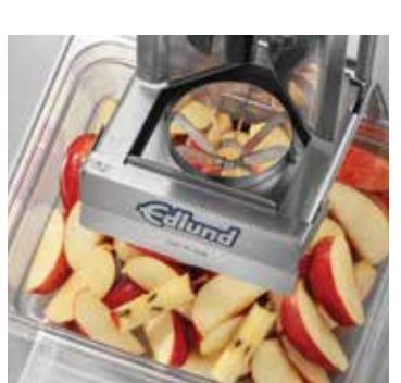
French fries, steak fries, lemon wedges, sliced and diced tomatoes & onions, even cored apple wedges; just snap in the appropriate blade and pusher. The Max-Cut does more volume, faster, than any other manual product.