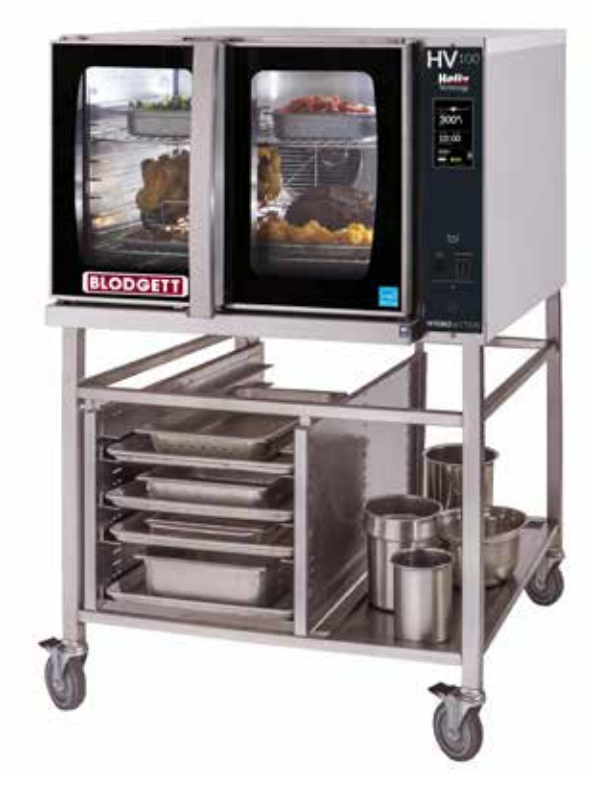
Shown on optional stand with casters