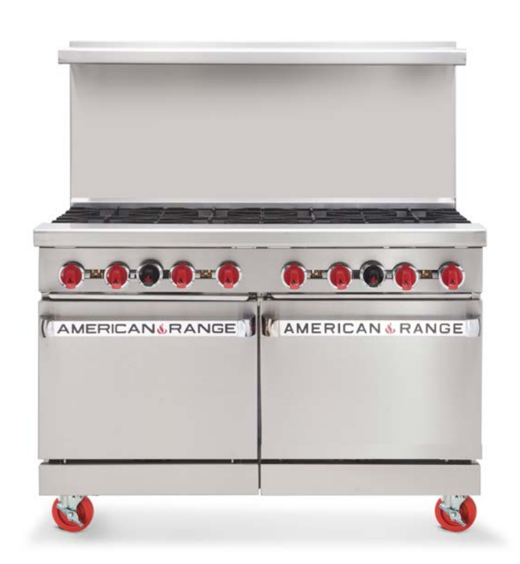
Model AR-8 Shown with optional casters. Full Sheet pan 18" \times 26" fits front to back

The Heavy Duty Restaurant Range Series by American Range was designed for continuous rugged use and performance. All the latest technology is incorporated to give you the best value for your money.