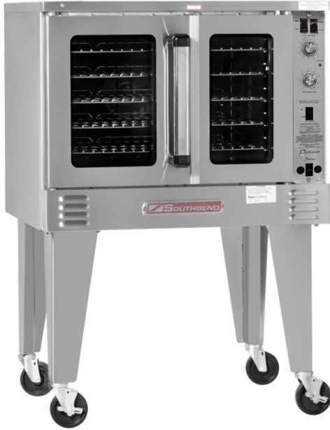
PCG50S/S shown with optional casters