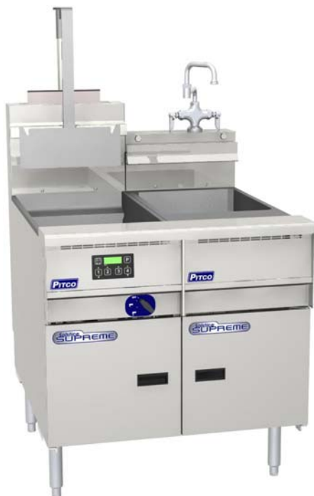
Model SSPG14/SSRS14 Shown with option: Single Basket Lift