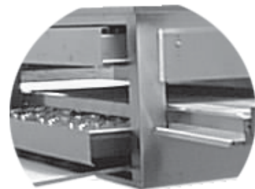
Removable panels for easy cleaning "U.S." Patent # 6,192,877 B1

Ideal for a variety of cooking applications including pizza, seafood, omelettes and other egg dishes, pre-cooked meats, cookies, bakery products, pita breads, heating plated Mexican food and hot submarine sandwiches.