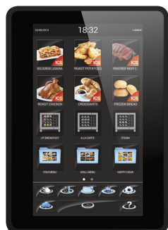
LCD 10" Touch Screen