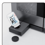
SOLID CAL (only for models with boiler)