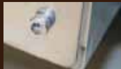
EASY CLEAN PANEL DESIGN