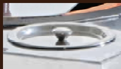
STAINLESS STEEL BOWL WITH SS LID*