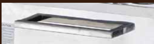
STAINLESS STEEL TOWEL HANGER