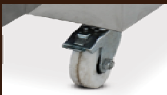
LOCKABLE HEAVY DUTY WHEELS