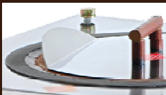
HEAT RESISTANT HANDLE ON MOUTH COVER