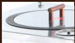
HEAT RESISTANT HANDLE ON MOUTH COVER