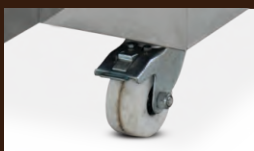
LOCKABLE HEAVY DUTY WHEELS

DOUBLE BODY DOUBLE INSULATION WITH CERAMIC SANDWICH