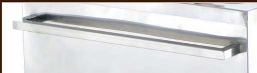
STAINLESS STEEL TOWEL HANGER