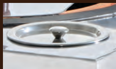
STAINLESS STEEL BASTING BOWL