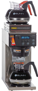
Model AXIOM-3T (decanters sold separately) Dimensions: 18.9" H x 8.5" W x 17.7" D (48cm H x 21.6cm W x 44.9cm D)