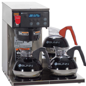
Model AXIOM-3 (decanters sold separately) Dimensions: 16.8" H x 16.5" W x 17.7" D (42.7cm H x 41.9cm W x 44.9cm D)