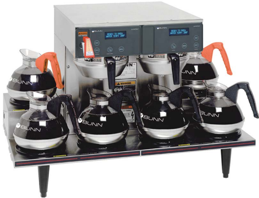
Model AXIOM 0/6 Twin (decanter sold separately)

Dimensions: 20.5" H x 30.3" W x 17.7" D (52.1cm H x 77cm W x 45cm D)